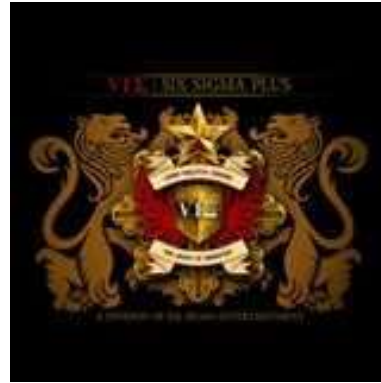
Six Sigma Plus