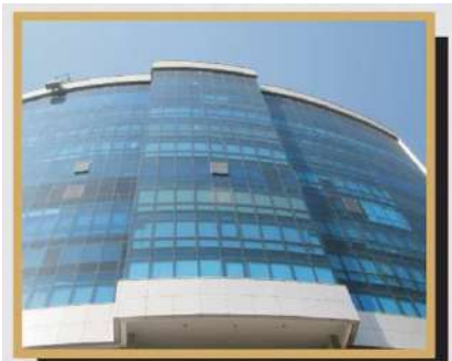
Dill Khusha Tariq Road