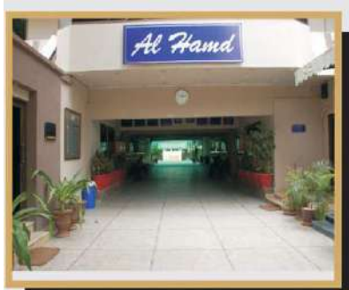
Al Hamd Academy Tariq Road