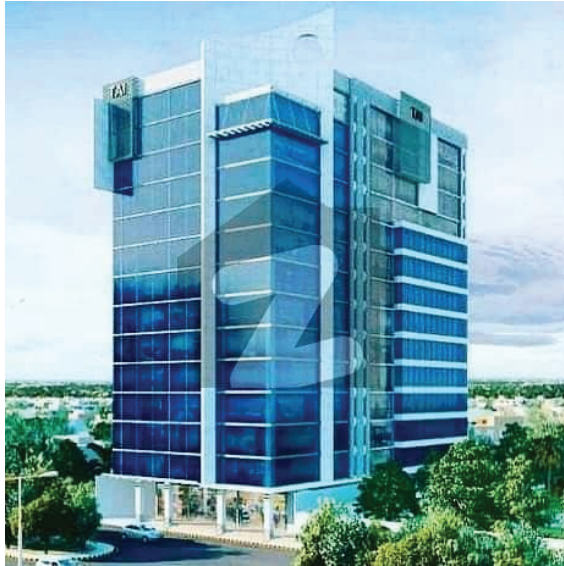
ROSHAN TRADE CENTER