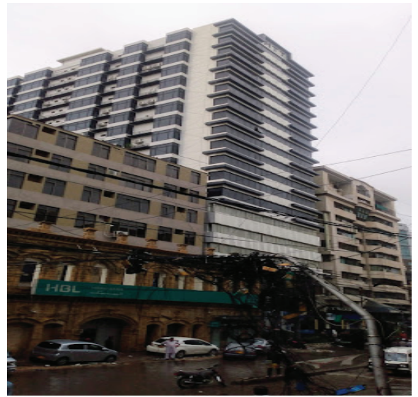
SHARJAH TRADE CENTER