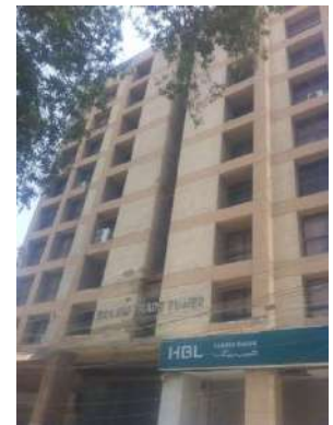
IBRAHIM TRADE TOWER