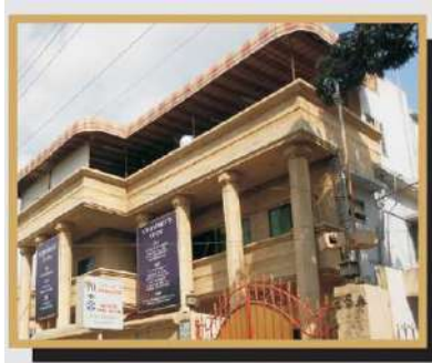
Tabani Academy Allah Wali Chorangi Nursary