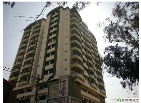
SAIMA PAARI RESIDENCY